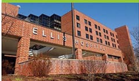
Ellis Hospital – Schenectady, New York

Results: The complaints and problems associated with the rubber plant disappeared and there was a marked improvement in interior air quality.