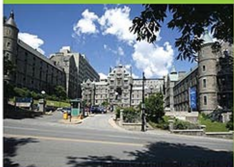
Royal Victoria Hospital – Montreal, Quebec

Results: Results were almost immediate. Smoke was reduced and residual smoke odors disappeared. Dynamic V-Banks were added as part of a subsequent HVAC system upgrade serving a large resident facility. Shortly thereafter it was noticed that a stubborn urine odor was gone. In open wound patient rooms, several Dynamic G-375 Germicidal Systems have been installed.