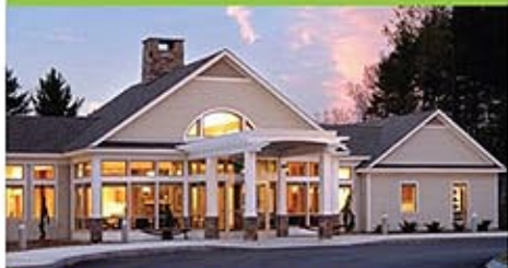
Cancer Care Center of York County – Sanford, Maine

Challenge: When the facility opened in 2006, its proximity to a nearby rubber plant resulted in odors frequently being brought into the building with the ventilation air. The odors exacerbated nausea problems with oncology patients.