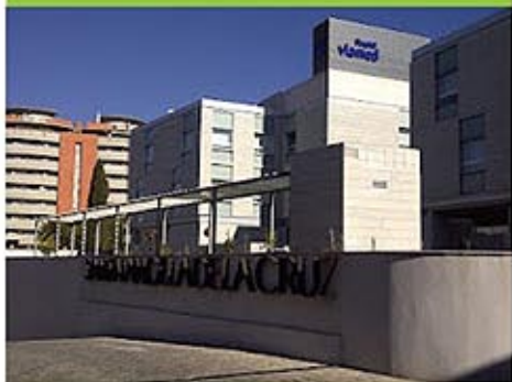
Hospital Viamed – Seville, Spain

Results: The Dynamic V8 Air Cleaners eliminated the odors. The hospital was pleased not only with the elimination of the odor complaints, but they were also elated with the longer filter service life. Previously, hospital personnel were replacing 2" passive pleated filters every few months. The Dynamic V8 replacement media will not require replacing for several years.