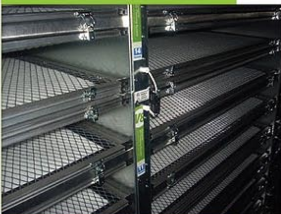
Dynamic V8s in a custom air handler

The Dynamic V8 provides MERV 13-15+ performance without ionizing or Ozone generation—plus VOC reduction and superior capture of dangerous ultra-fine particles. It is constructed to eliminate bypass, a critical issue for maximum performance. The Dynamic V8 holds up to ten times the dust of standard cartridge and bag filters and up to 100 times the dust of shallow-bed passive filters. Loading is critical to the ongoing costs of filtration. Unlike passive filters (which load primarily on the face of the media), the Dynamic V8 loads throughout the full 1" depth of each of the eight media pads and 360° around each fiber. This three-dimensional loading accounts for the V8's dramatic ability to collect contaminants. And the active-field technology tightly holds what has been collected so it is not shed back into the airstream. This means maintenance intervals measured in years instead of months.