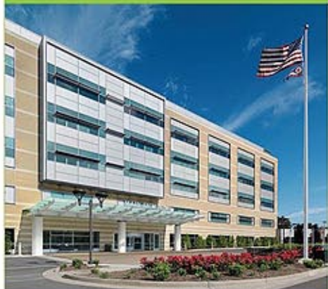
Firelands Regional Medical Center – Sandusky, Ohio

Challenge: Replacing three obsolete critical AHUs, owners also wanted to 1) exceed the U.S. Department of Health & Human Services minimum MERV rating for final filtration in patient areas, 2) minimize noticeable odors and harmful particulate typically introduced as ventilation from ambient sources including helicopter fumes and idling ambulances, 3) create a highly effective level of indoor air quality and healing environment, 4) extend media life and minimize the burdens from having to replace media, and 5) reduce energy and operating costs.