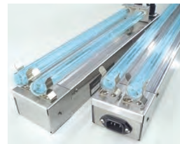
Hardwire fixtures are also available