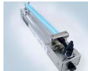
Water-tight lamp connection

OPERATION & MAINTENANCE MANUAL: Visit the Document Library on our website to download the CC Series Operation and Maintenance Manual.