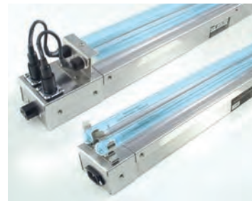
Connect multiple fixtures to one power source